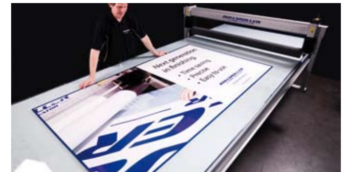
10. The result: a smooth sign without creases or bubbles.

"We've got over 20 ROLLSROLLER®s today. That says a lot about the results."