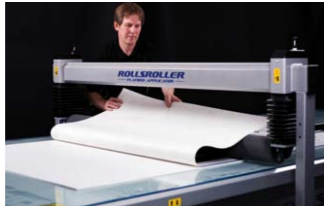
4. Fold half of the foil over the roller.