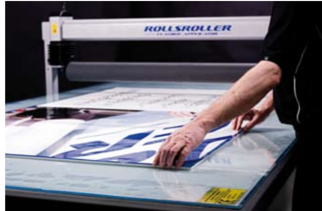
2. Place the design on the substrate.