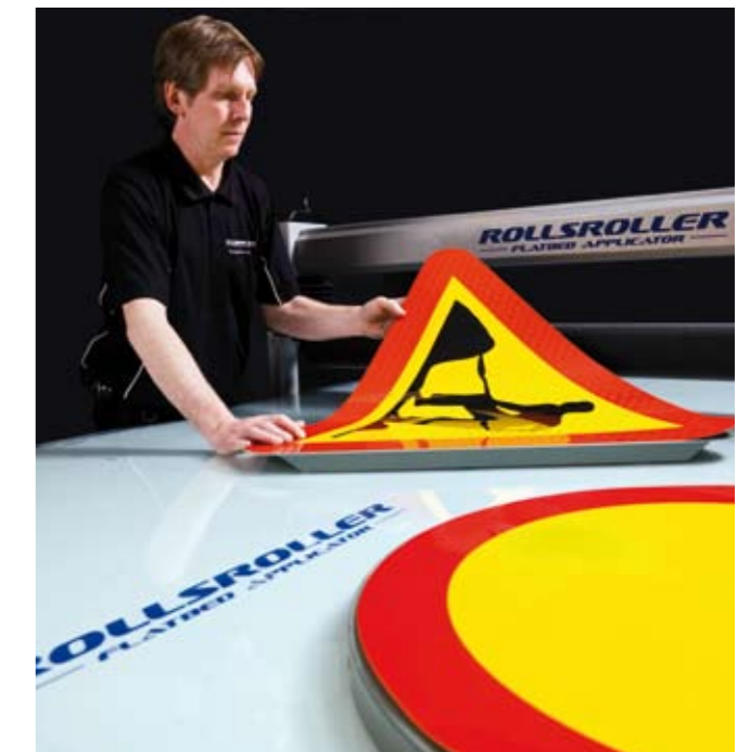
ROLLSROLLER® is compatible with all types of self-adhesive foil, including road signs.

"This machine rocks. We love it. Jobs that used to take an hour, we can now fix in ten minutes."